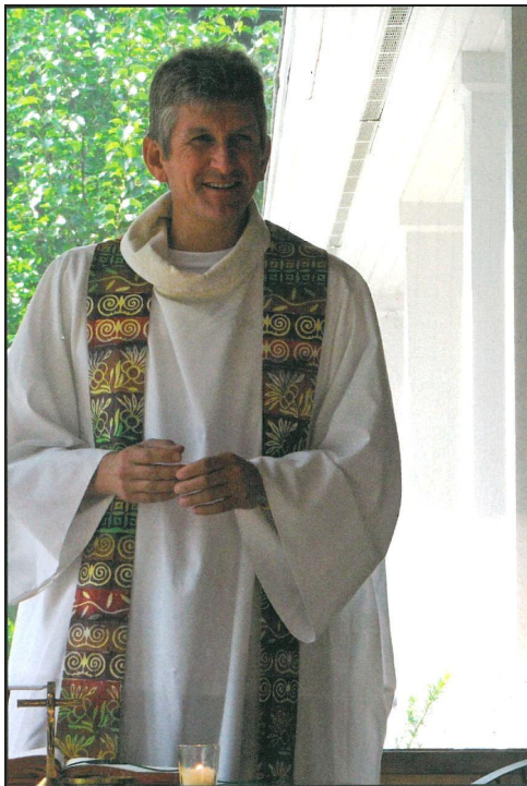
The highpoint of our annual summer vacation is celebrating Mass together as a family.